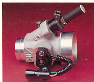
Cast aluminum throttle body

Model line includes: 250 MX, 250 CC, 406 MX, 406 CC, 350 STD, 350 MX, 350 ES, 350 ES MX, 350 ES CC, 604 STD, 604 MX, 604 ES, 604 ES MX, 604 ES CC.