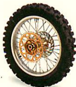
Machined billet Talon® hubs and stainless steel spokes.