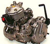
Rotax two-stroke engines feature six-speed transmissions.