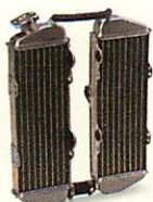
Oversized radiator keeps engine cool for extended life.