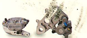
Brembo® brakes provide smooth, reliable stopping power.